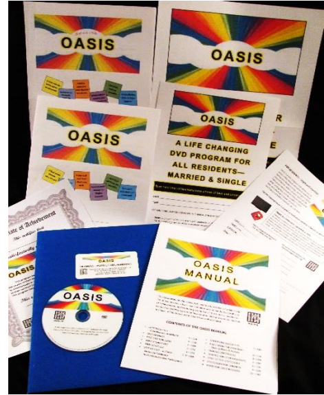
Oasis Chaplain's Pack

ME programs reduce recidivism. To help with this great need, we are lowering our prices so more chaplains, in turn, will help their residents. NMEPM Board of Directors